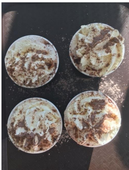
Mid-Station Hot Chocolate